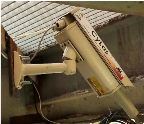
The Mintek CyLas

The CyLas is an on-line instrument for measuring a hydrocyclone's underflow flare discharge angle.