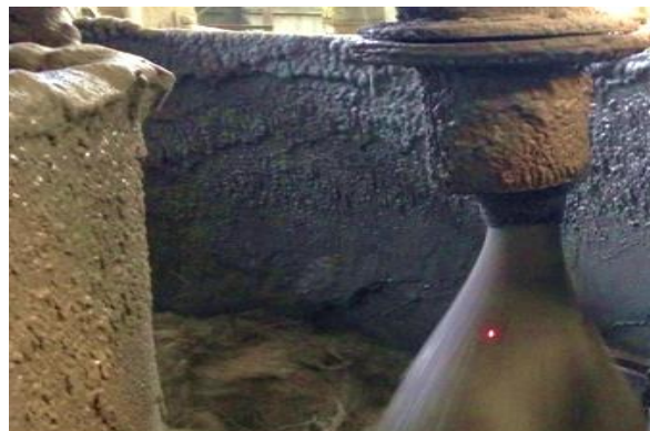
Hydrocyclone monitored by the CyLas

The image to the right shows a hydrocyclone monitored by the CyLas. The CyLas can be mounted several meters from the hydrocyclone if necessary. The red dot on the hydrocyclones underflow is the CyLas laser light which assists with the aiming of the device.