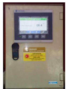
A CyLas field display unit

The standalone option includes a user-friendly industrially rated touch panel. This protected screen can show the current discharge angle or trends of previous operation. The display can also be used to configure the CyLas (with password protection for critical parameters). The values from this unit can be used by the plant's PLC and SCADA network.